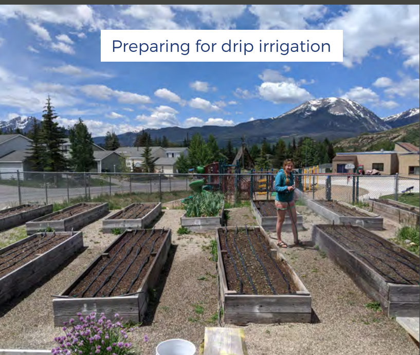
Preparing for drip irrigation