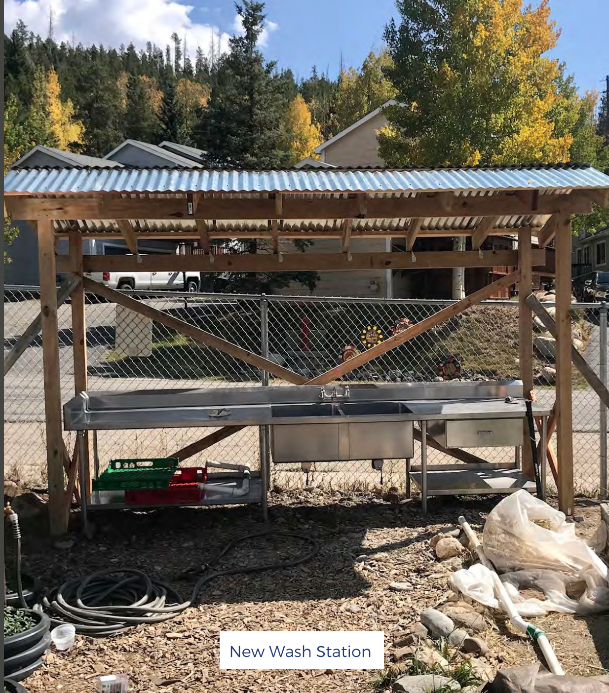
New Wash Station