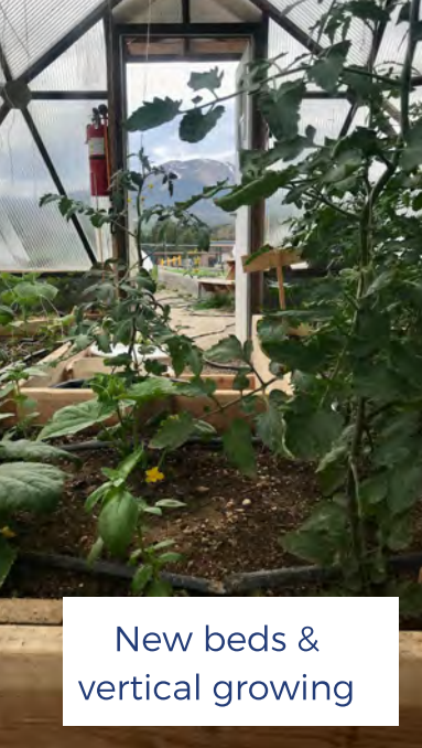
New beds & vertical growing