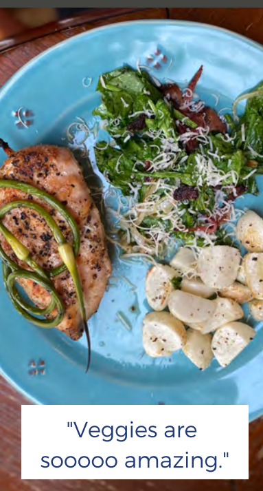
"Veggies are sooooo amazing."