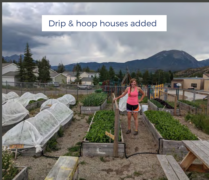
Drip & hoop houses added