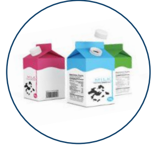
MILK & JUICE CARTONS