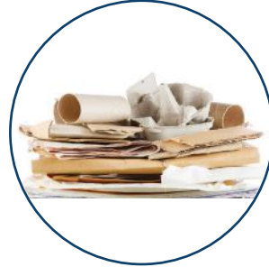
NEWSPAPER, PAPER, CARDBOARD & PAPERBOARD