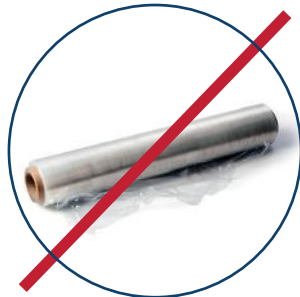
NO PLASTIC PACKAGING, WRAP OR FILM