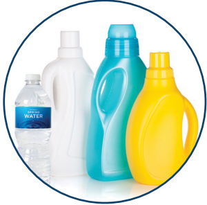
#1-#7 PLASTIC BOTTLES & TUBS

ALL OF THESE RECYCLABLES CAN GO INTO ONE BIN