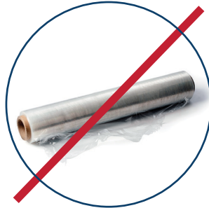
NO PLASTIC PACKAGING, WRAP OR FILM