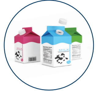
MILK & JUICE CARTONS