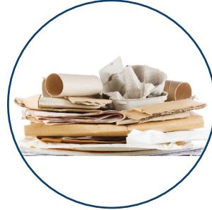
NEWSPAPER, PAPER, CARDBOARD & PAPERBOARD