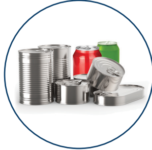
ALUMINUM & TIN CANS (PLEASE RINSE)