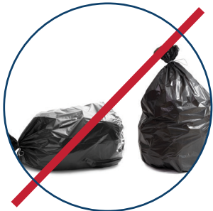
NO PLASTIC BAGS OR TRASH Do not put recyclables in plastic bags.