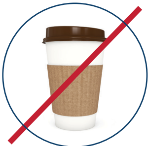
NO PAPER CUPS OR TO GO CONTAINERS