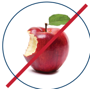
NO FOOD WASTE