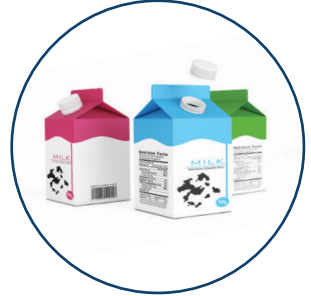
MILK & JUICE CARTONS